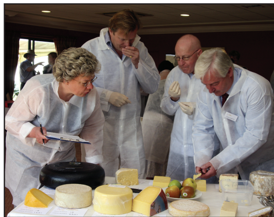
Four judges, each considering a different aspect of the cheese under evaluation, from left to right, general appearance, the aroma, flavor, and body and texture. Sixteen judges were assembled for the competition, among them the Michelin-starred chefs Andrew Baird and Shaun Rankin.

Scoring standards were established as a maximum of 10 points for general appearance,